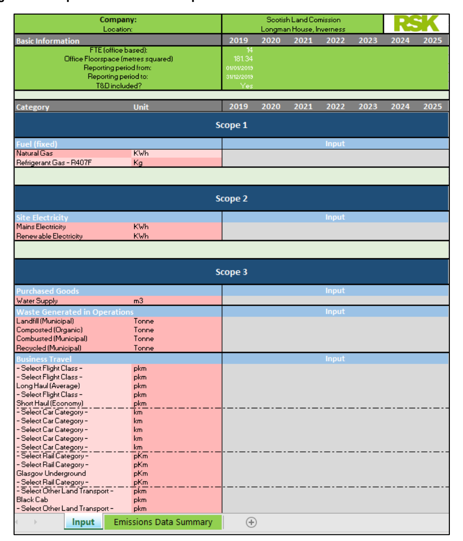
Figure 1. Sample taken from data input sheet